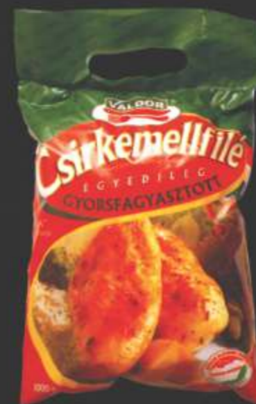
Piept de pui file