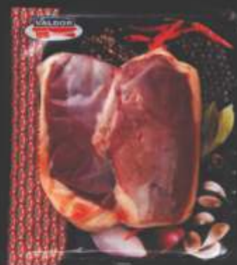
Piept file cu piele de gâsc