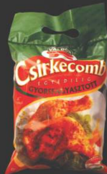
Pulp de pui