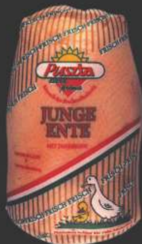
Ra cu m runtaie