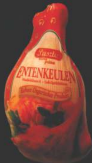
Pulpe de ra