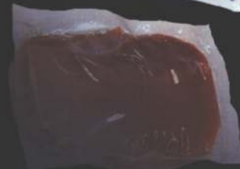
Piept de curcan file