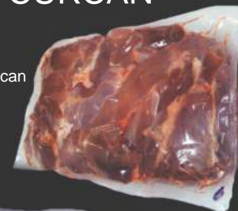
Pulp de curcan