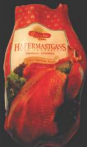
Gâsc cu m runtaie