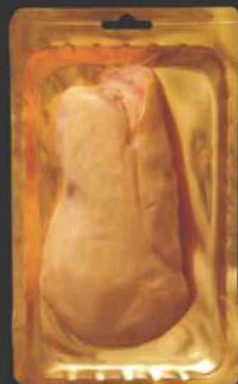
Ficat de gâsc