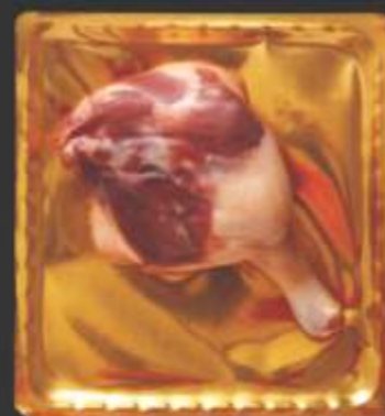
Pulp de gâsc