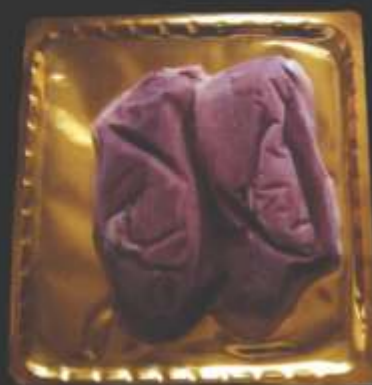
Piept file cu piele